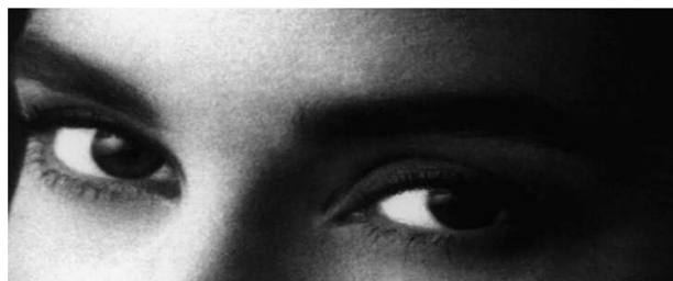
Hate Surprised Kind Cross