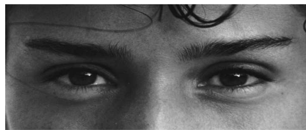
Friendly Sad Surprised Worried