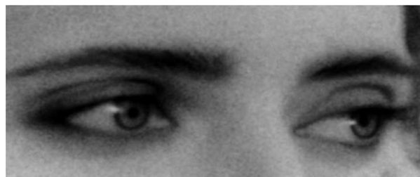
Unkind Surprised Cross Sad