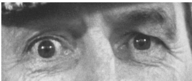
Jealous Scared Relaxed Hate

Some people find this very easy and others find it more difficult. Some researchers have tried to link this to autism.